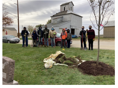
Get to know your neighbors. There are some wonderful people living in Steward!